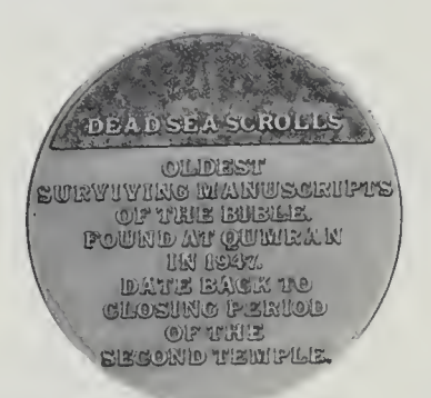
Lot No. 2518